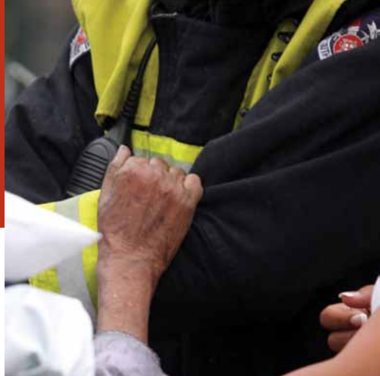
Quakers Hill Nursing Home fire