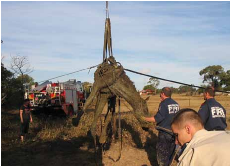
A high level of skill is required when conducting large animal rescues

getting stuck in mud all over the countryside. For a month I responded with the team to lots of different rescues but the one that makes every Australian laugh was a call to 20 European carp fish in a puddle. I will say no more about that other than it was not a joke.