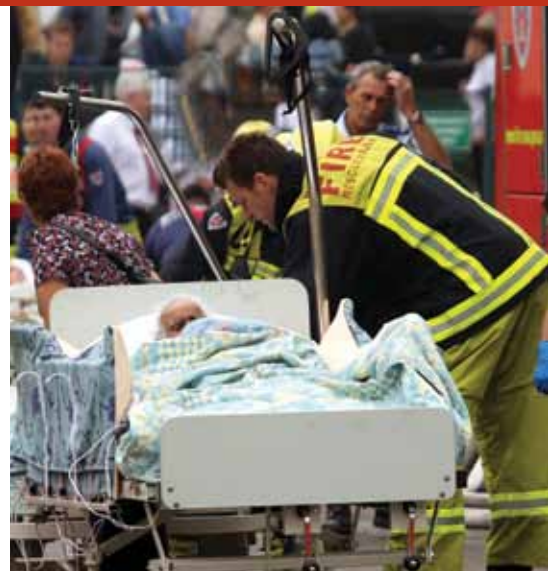
Quakers Hill Nursing Home fire

"While the collected data is still being analysed, observed data on the day showed the unsprinklered room achieved a maximum temperature at ceiling height of 1167°C and went to flashover in about 22 minutes," Superintendent Lewis said.