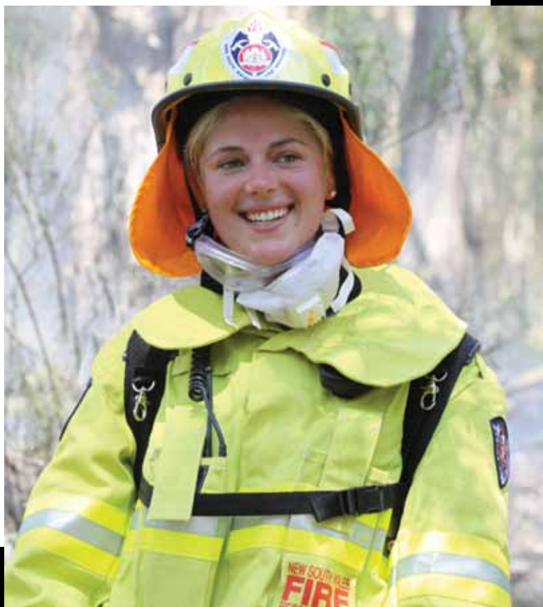
Retained firefighter at an incident