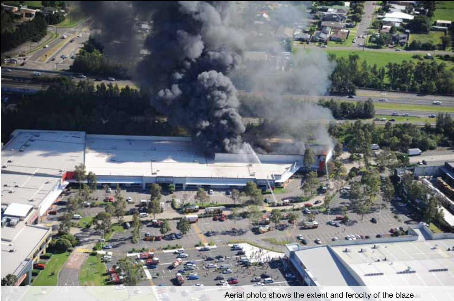
Aerial photo shows the extent and ferocity of the blaze