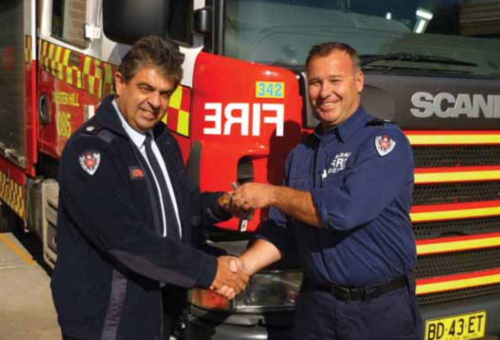
Chester Hill station becomes heavy hazmat

“This new Heavy Hazmat station gives ME3 zone a great advantage and allows FRNSW to further enhance fire and hazmat protection in this area,”