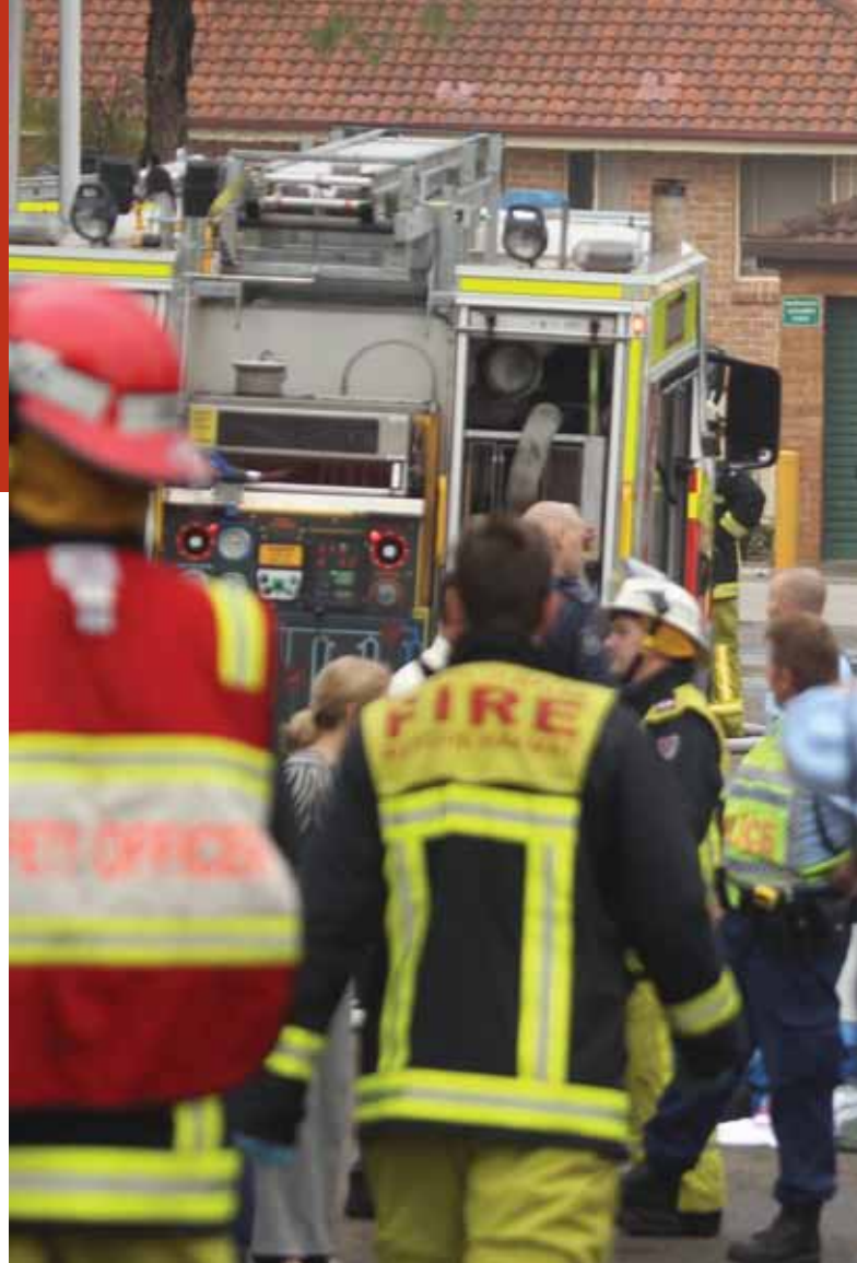
Quakers Hill Nursing Home fire

Ambulance paramedics set up a triage area on the front lawn and in the driveway, with many residents suffering severe smoke inhalation and, in some cases, burns as well. Paramedics conveyed those most seriously injured to hospital as quickly as possible.