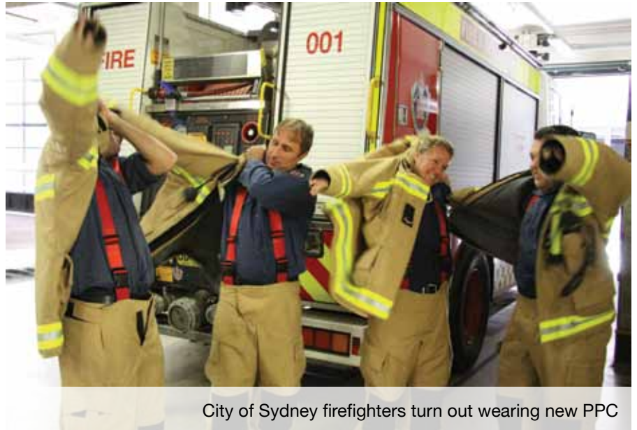
City of Sydney firefighters turn out wearing new PPC

The main change to the Standard that affected FRNSW was the requirement for the structural coat and trousers to be stand-alone garments. This meant that the layered approach to PPC was no longer acceptable.