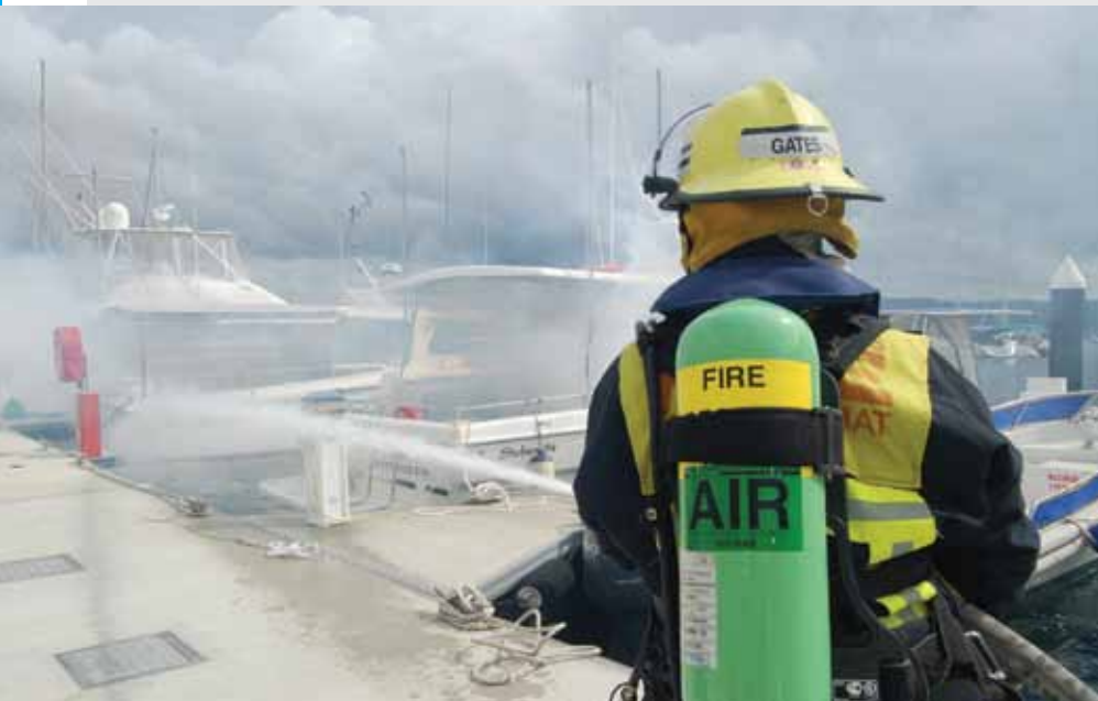
A FRNSW firefighter “extinguishes” the boat fire

Firefighters raced to the Royal Motor Yacht Club at Pittwater as thick blue and orange smoke poured from valuable yachts. Three motorboats were apparently engulfed in flames, with one burning through its moorings and drifting out into the bay, potentially creating havoc for other craft. Meanwhile, marina staff were trapped at the end of one of the finger wharves.