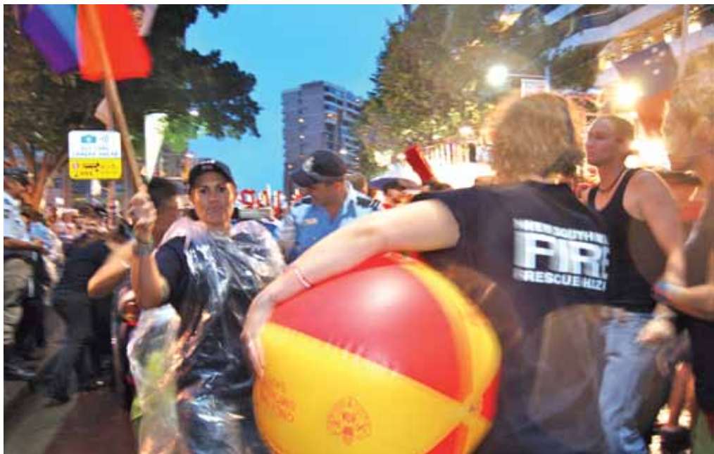
Part of the FRNSW contingent in the Sydney Mardi Gras 2012