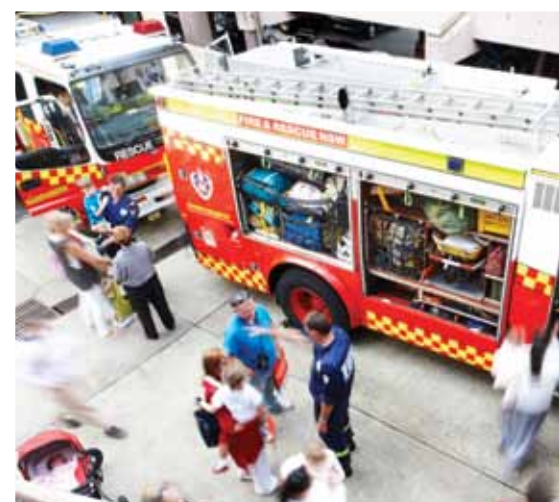
Open Day at local fire stations

Well done and thank you to everyone who participated in Fire Prevention Week and Open Day this year.