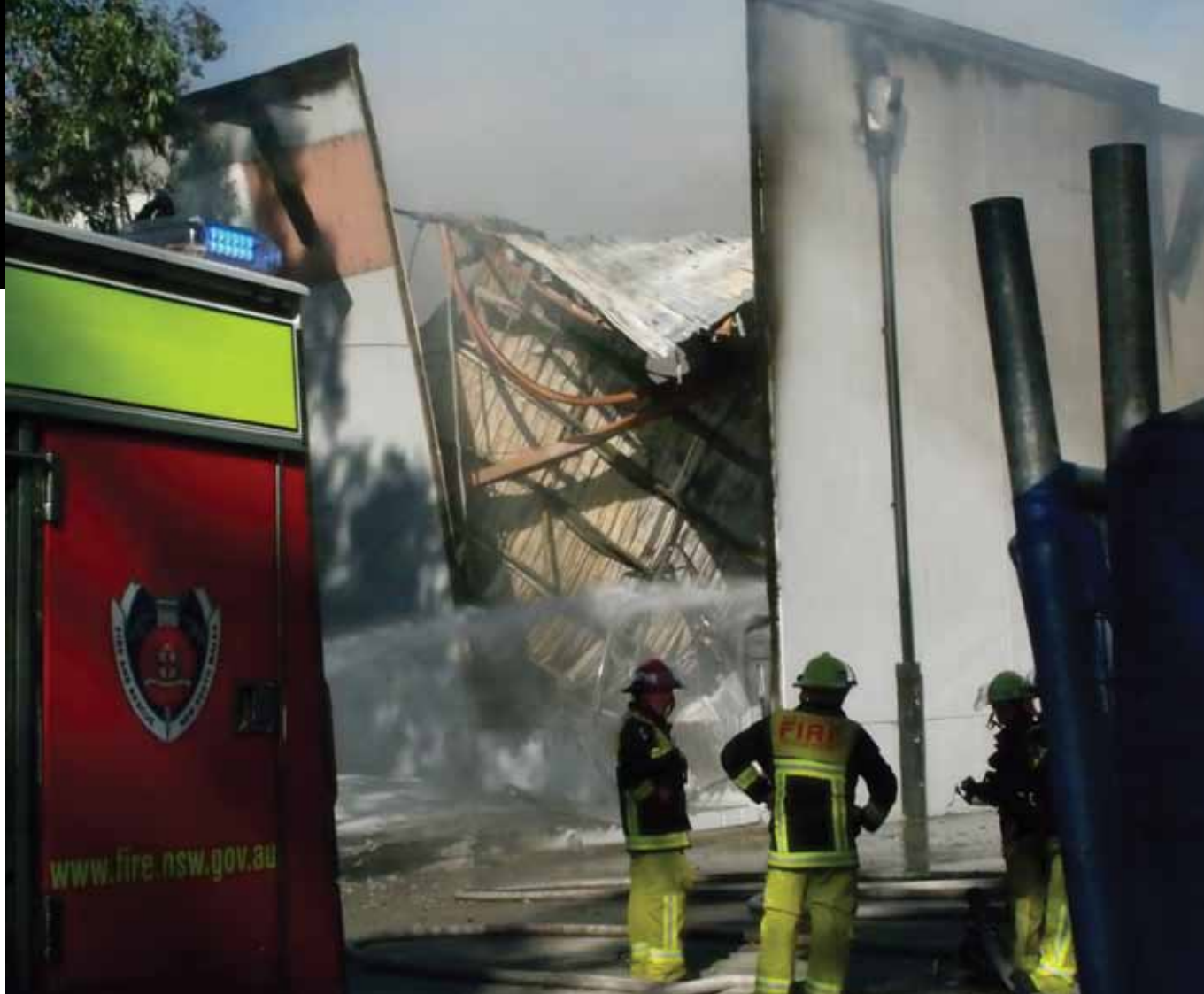
Firefighters assessing damage to affected tilt slab walls