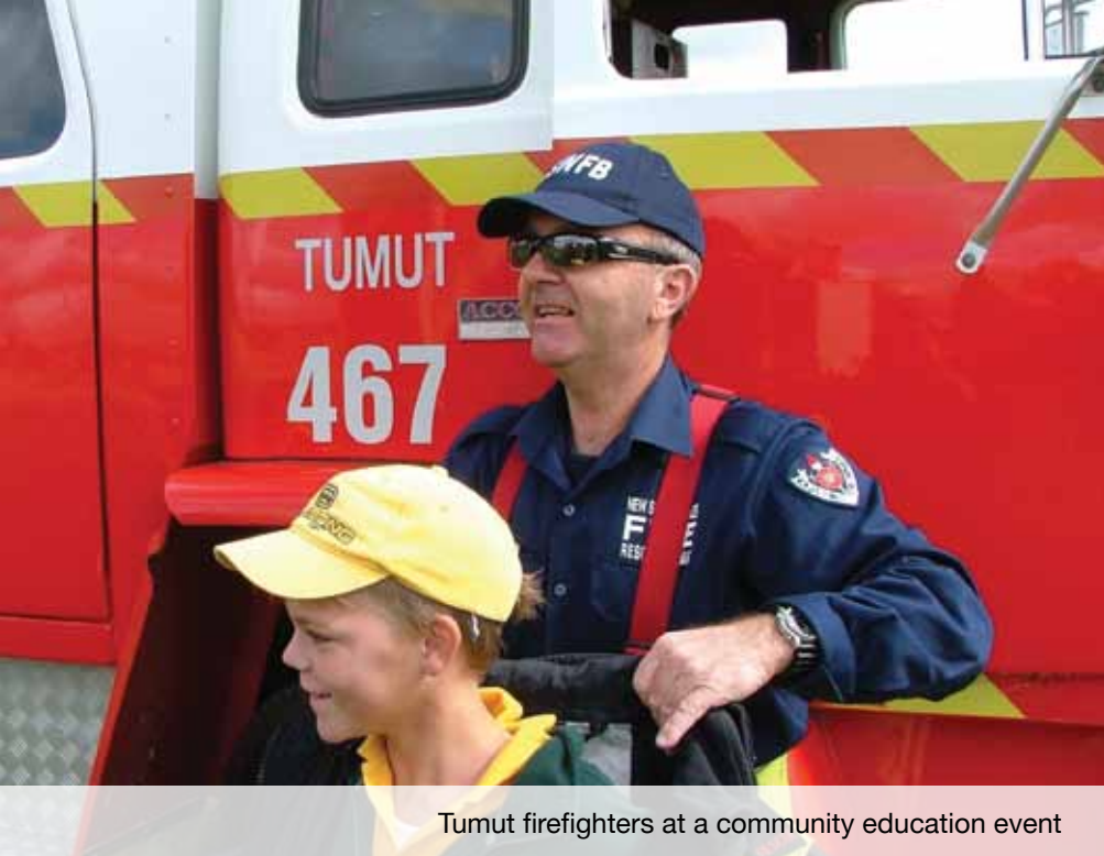
Tumut firefighters at a community education event