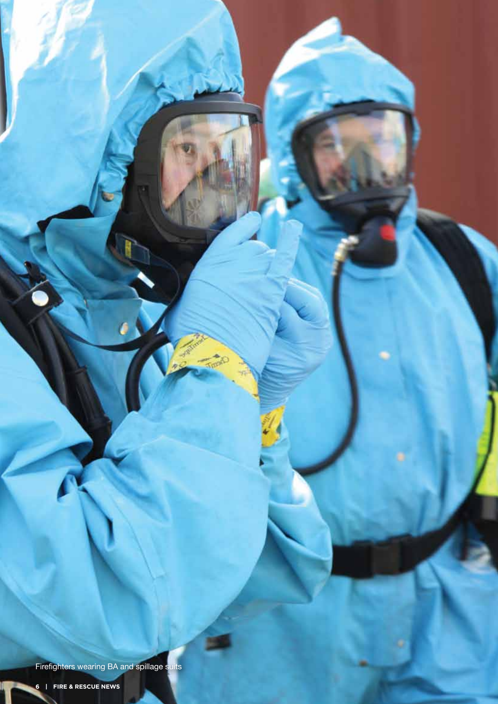
Firefighters wearing BA and spillage suits