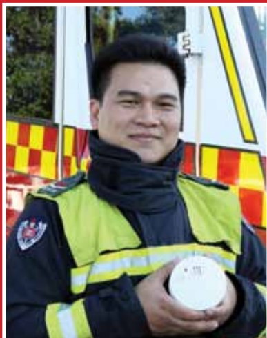
Firefighter highlights need for working smoke alarms

Firefighters were again very proactive for this year's 'Change Your Clock, Change Your Smoke Alarm Battery' campaign.