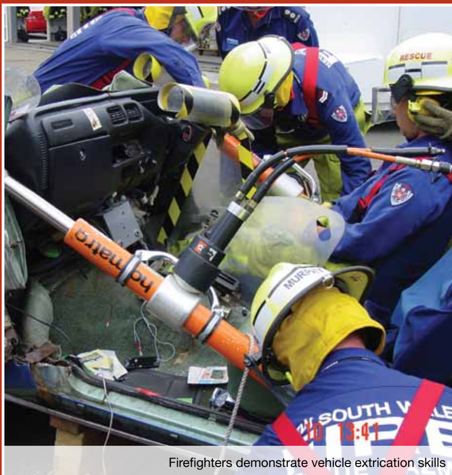
Firefighters demonstrate vehicle extrication skills