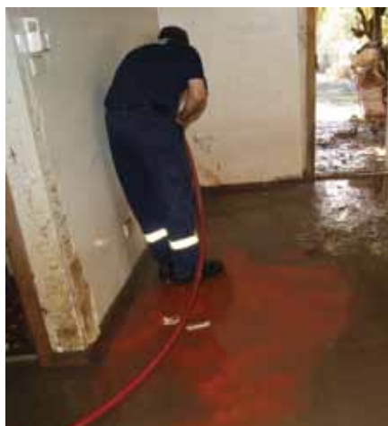
FRNSW mop up after the floods

Upstream, the town of Lockhart was inundated by floodwaters in the early hours of Sunday 4 March. The fire station and 100 homes were impacted, so retained firefighters worked through the night moving local residents, and the truck and equipment from the fire station, to higher ground. Once the flood waters receded, FRNSW crews from Lockhart, Turvey Park and Wagga Wagga worked with local RFS volunteers and the community to clean up the town.