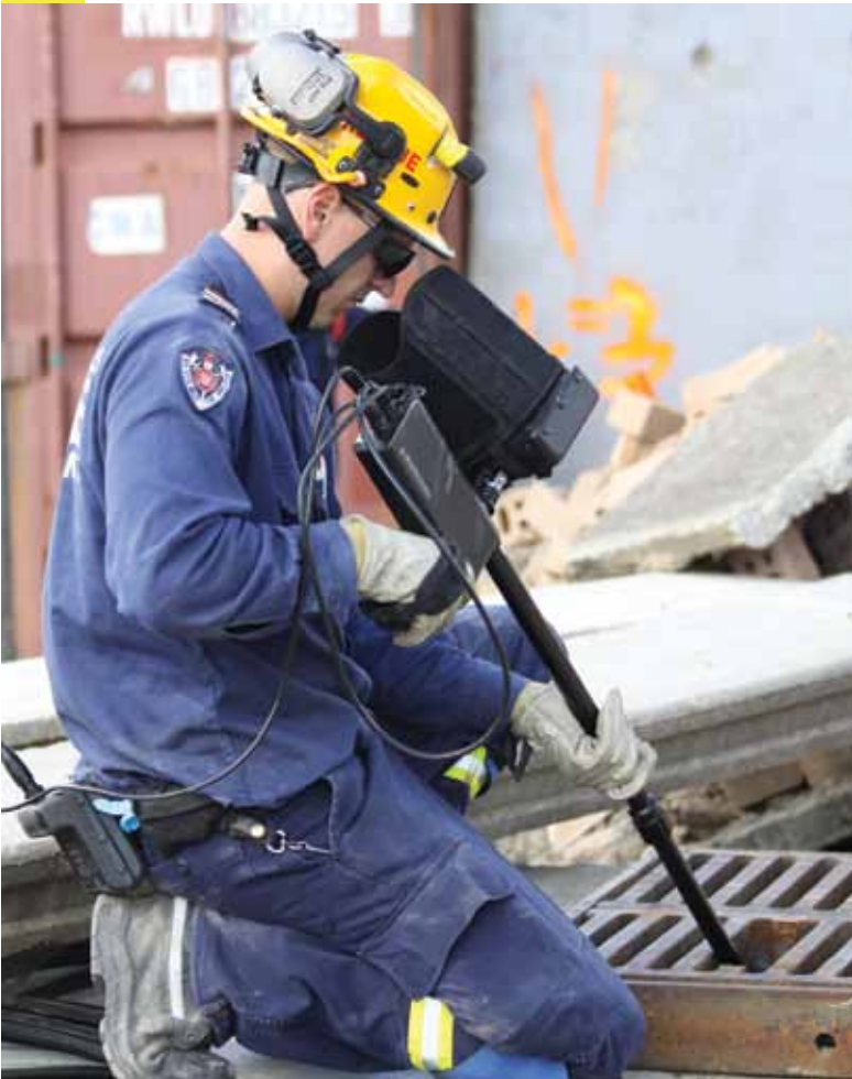
USAR officer using an Entry Link Camera

USAR 1 is a semitrailer fully loaded with urban search and rescue equipment and is based at Ingleburn Disaster Response and Rescue Education Centre. The semitrailer is one of seven USAR resources available for operational or training use in FRNSW. It carries equipment as ordinary as a garden spade, and equipment as specialised as the Entry Link Camera, the Delsar Life Detector and the Wohler Pipe Camera.