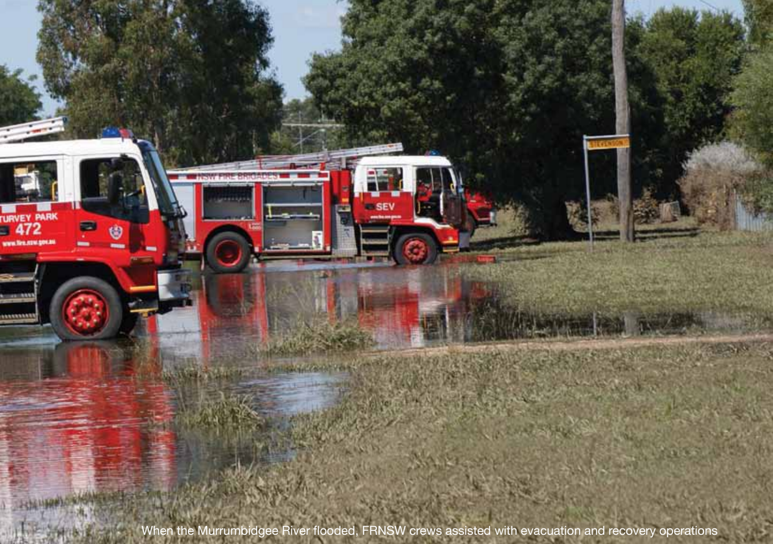
When the Murrumbidgee River flooded, FRNSW crews assisted with evacuation and recovery operations