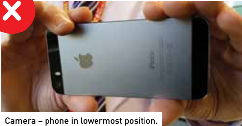
Camera – phone in lowermost position.