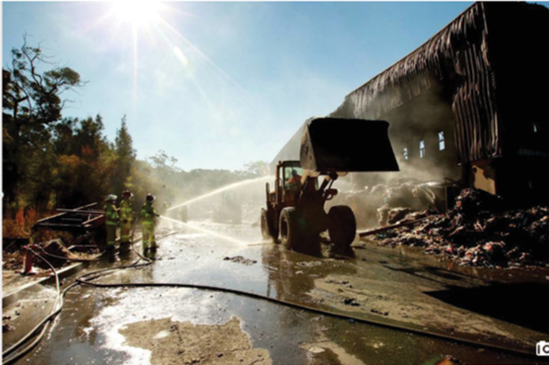
Somersby recycling plant fire