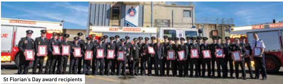
St Florian's Day award recipients