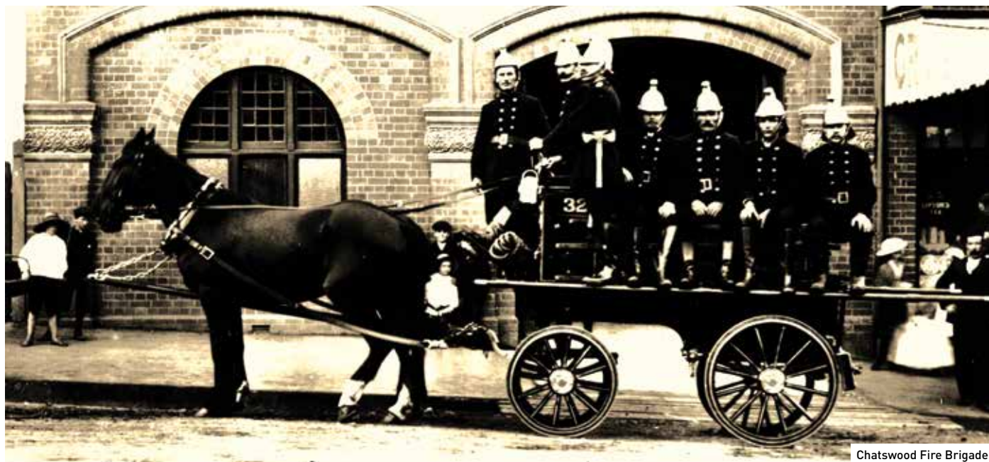
Chatswood Fire Brigade