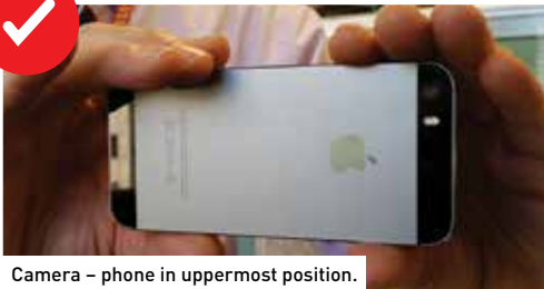
Camera – phone in uppermost position.