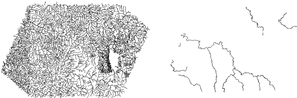
Figure 8: Sample region of AHGF mapped streams

There are nearly 2 million river segments present in the AHGFMappedStream table. This level of detail does not provide a clear picture of the rivers present in a given region. To achieve this, the major perennial rivers are used instead. An example of the difference in the level of detail is shown in Figure 8. Both figures show the same region near the ACT: on the left all river segments are shown; on the right only the major perennial ones are shown.